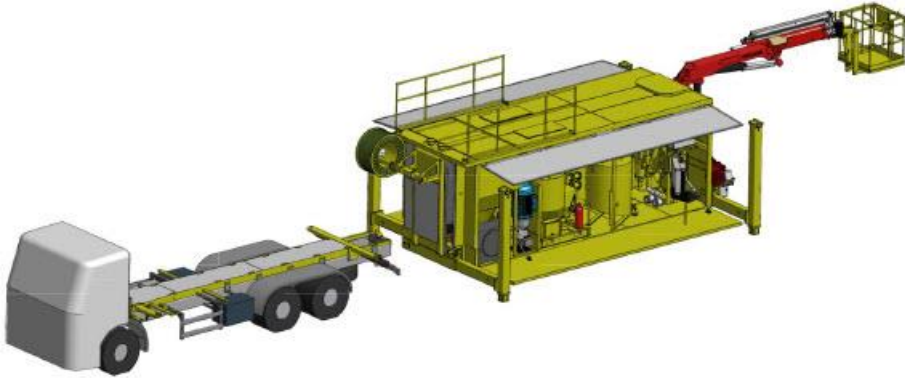
3D model of injection rig with Palfinger crane and AMV cage. Serial number 05-10569.

P.O Box 194, N-4402 Flekkefjord – Norway Tel: +47 38 32 04 20 – Mail: company@amv-as.no